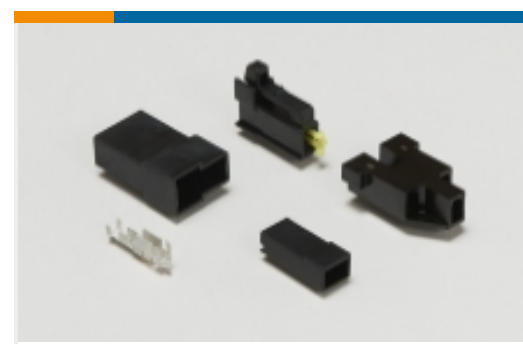
Magnet Wire Terminals(5)