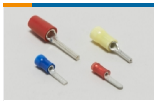
Crimp Wire Pins, Tabs &amp; Ferrules(5)